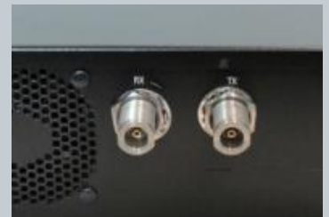
N-Type connections for your external duplexer