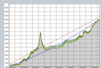
Aprisa XE path profile diagram