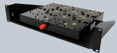
4RF 3.6 MHz TX/RX split duplexer