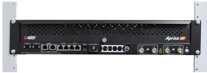
Rack mounted Aprisa SR+ Protected Station without duplexer

The Aprisa SR+ Protected Station is designed to mount in a standard 19" rack.