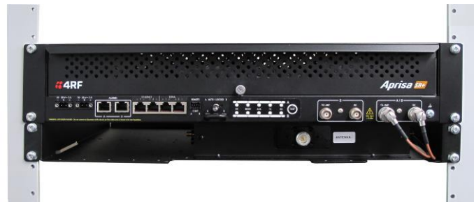
Rack mounted Aprisa SR+ Protected Station with duplexer

The Aprisa SR+ Protected Station has an earth connection point on the bottom right of the chassis. Use the supplied M4 screw to earth the enclosure to a protection earth.